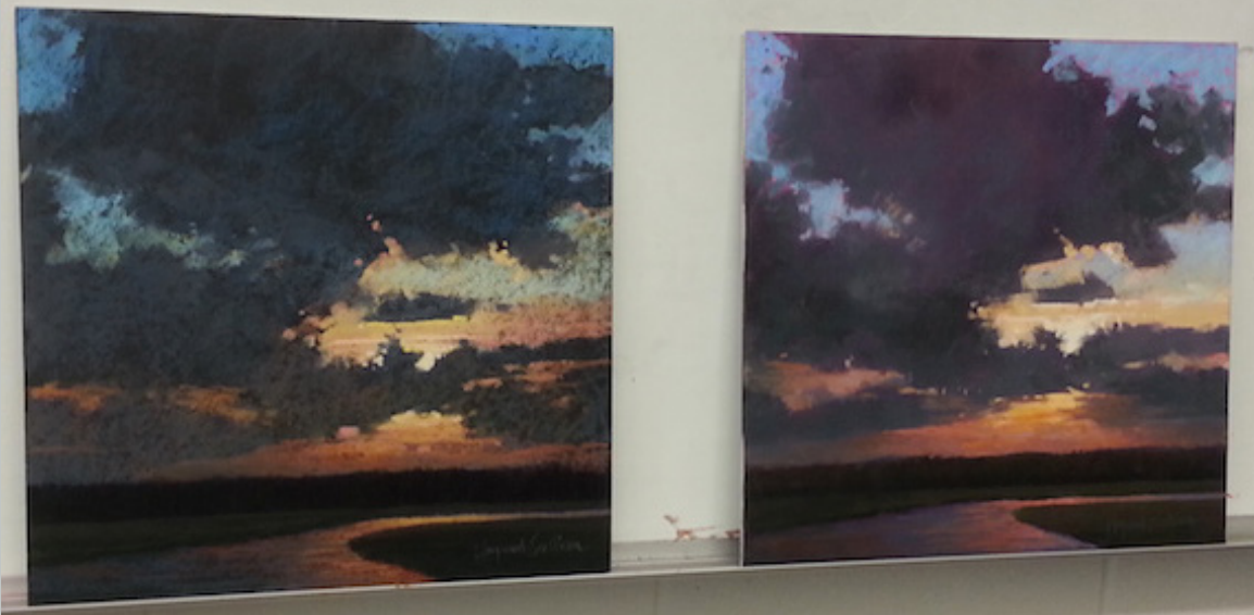
Painting on various tones of sanded and unsanded papers with different underpainting techniques created appreciably different moods in the paintings.