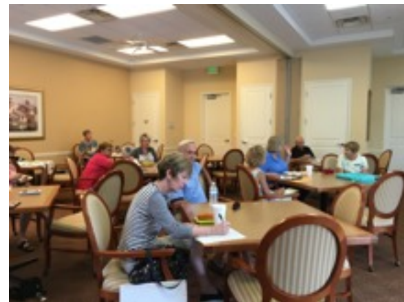
Our May meeting at Worthington