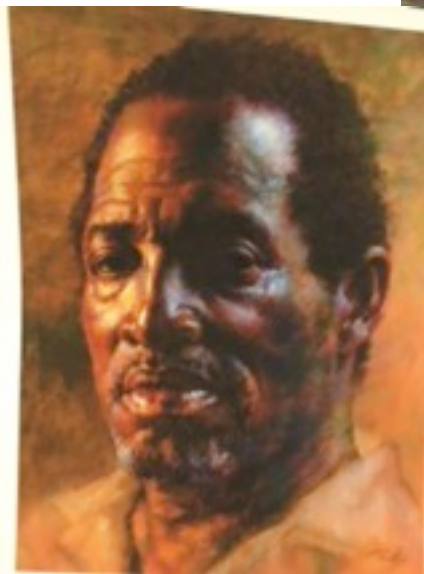
Some examples of Gwenneth Barth White's work.